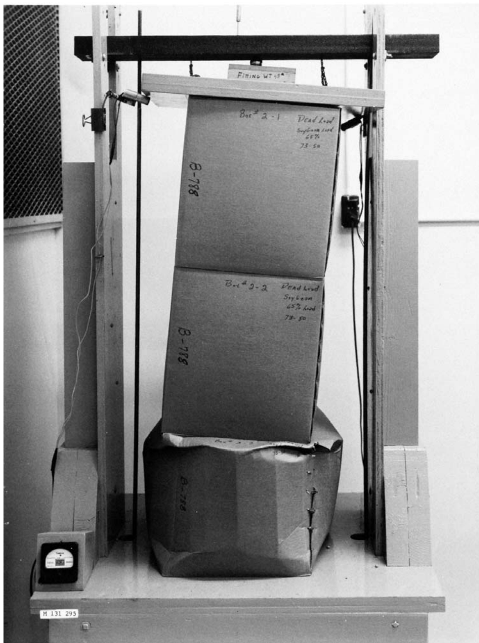
FIG. 1 Containers Under Constant Load of Dead Weights Imposed by Other Containers

for measuring the period of time required to cause container failure and means such as a dial indicator to measure box deformation (inches or millimetres) while under load, or an autographic recording device that records load and deformation over a period of time.